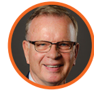
Hon. Bruce Ralston Minister of Jobs, Trade and Technology, Govt. of BC

Don't miss one of CLC's most popular receptions with welcome Keynote remarks by the Hon. Bruce Ralston, Minister of Jobs, Trade and Technology, British Columbia Provincial Government, along with spectacular views of the harbour, mountains, and live jazz in the background!